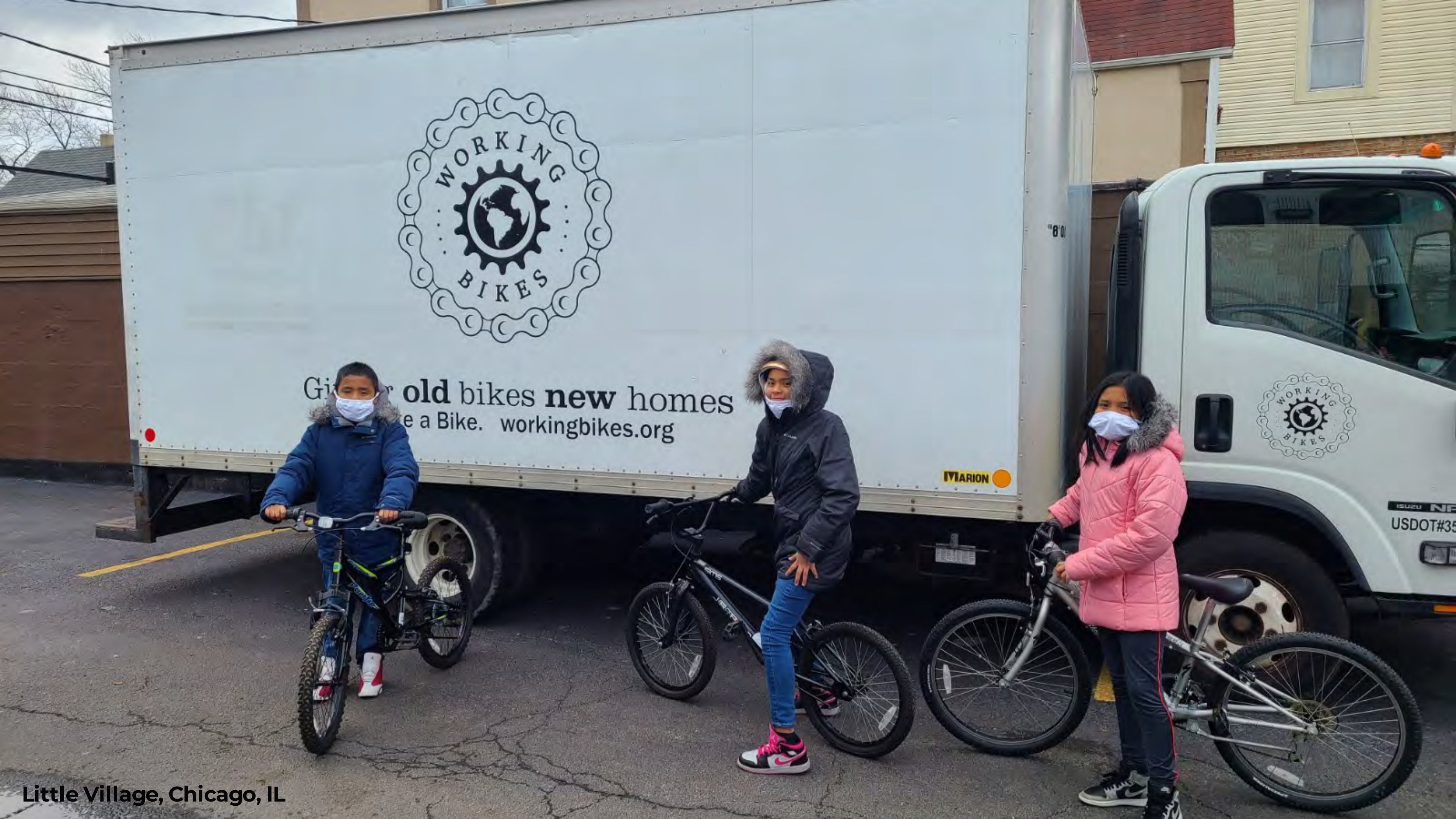
Little Village, Chicago, IL