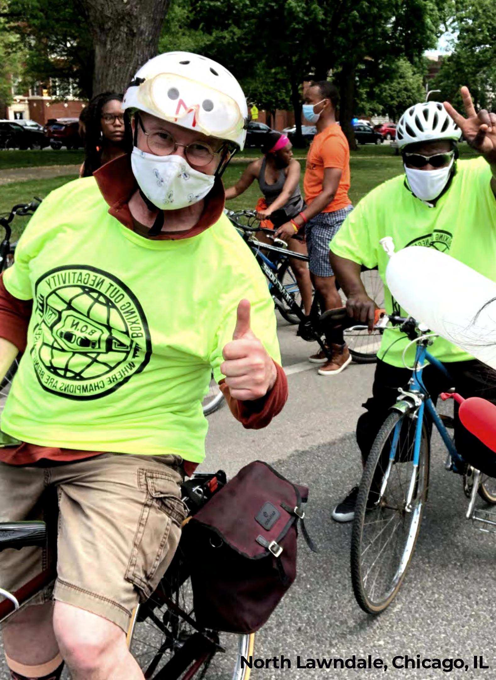
North Lawndale, Chicago, IL