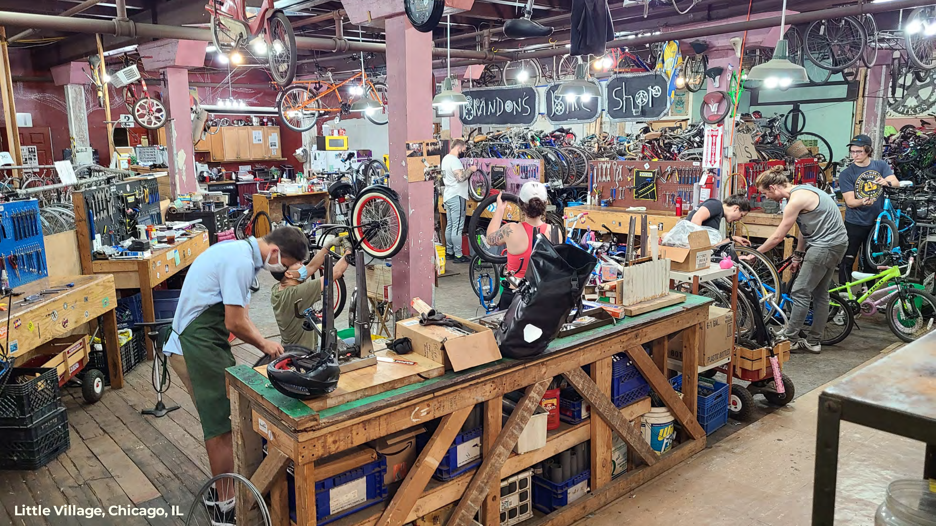
Little Village, Chicago, IL