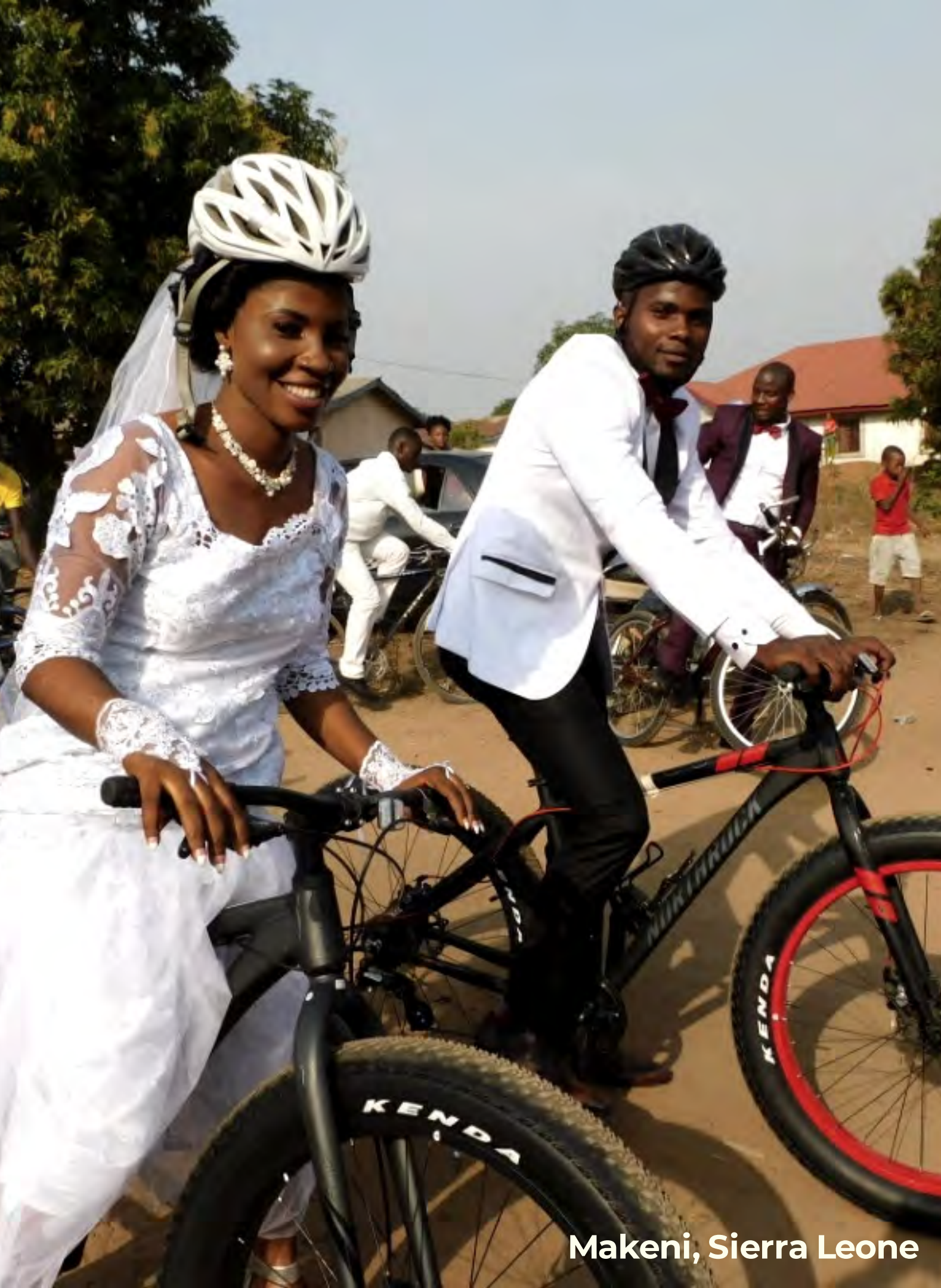
Makeni, Sierra Leone