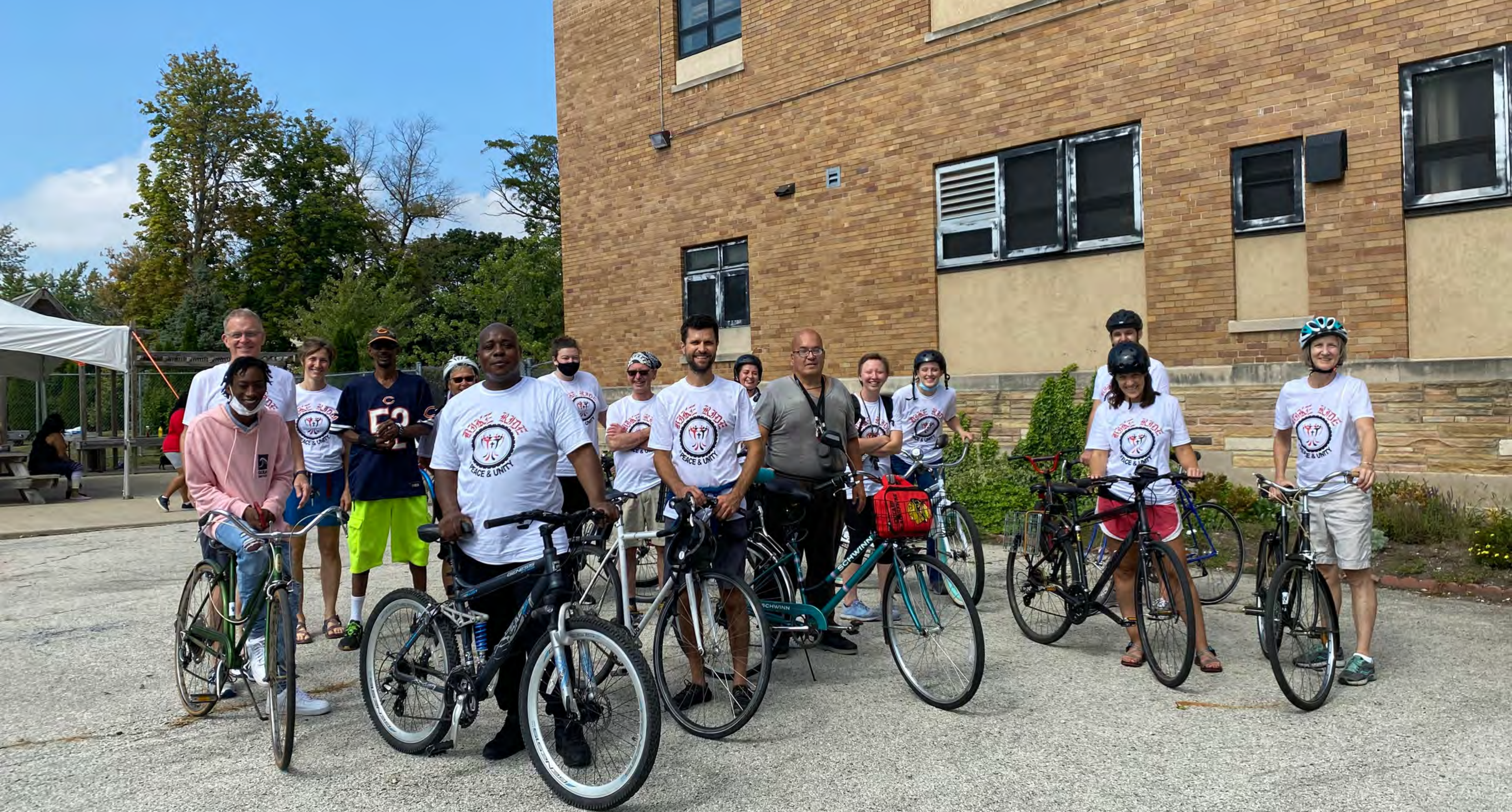
Back of the Yards, Chicago, IL