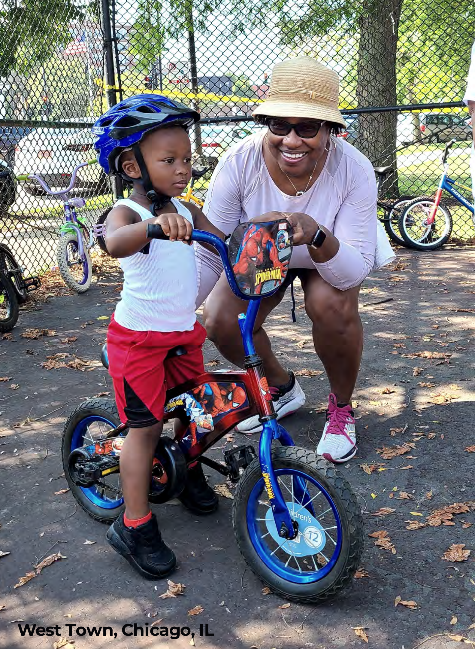
West Town, Chicago, IL