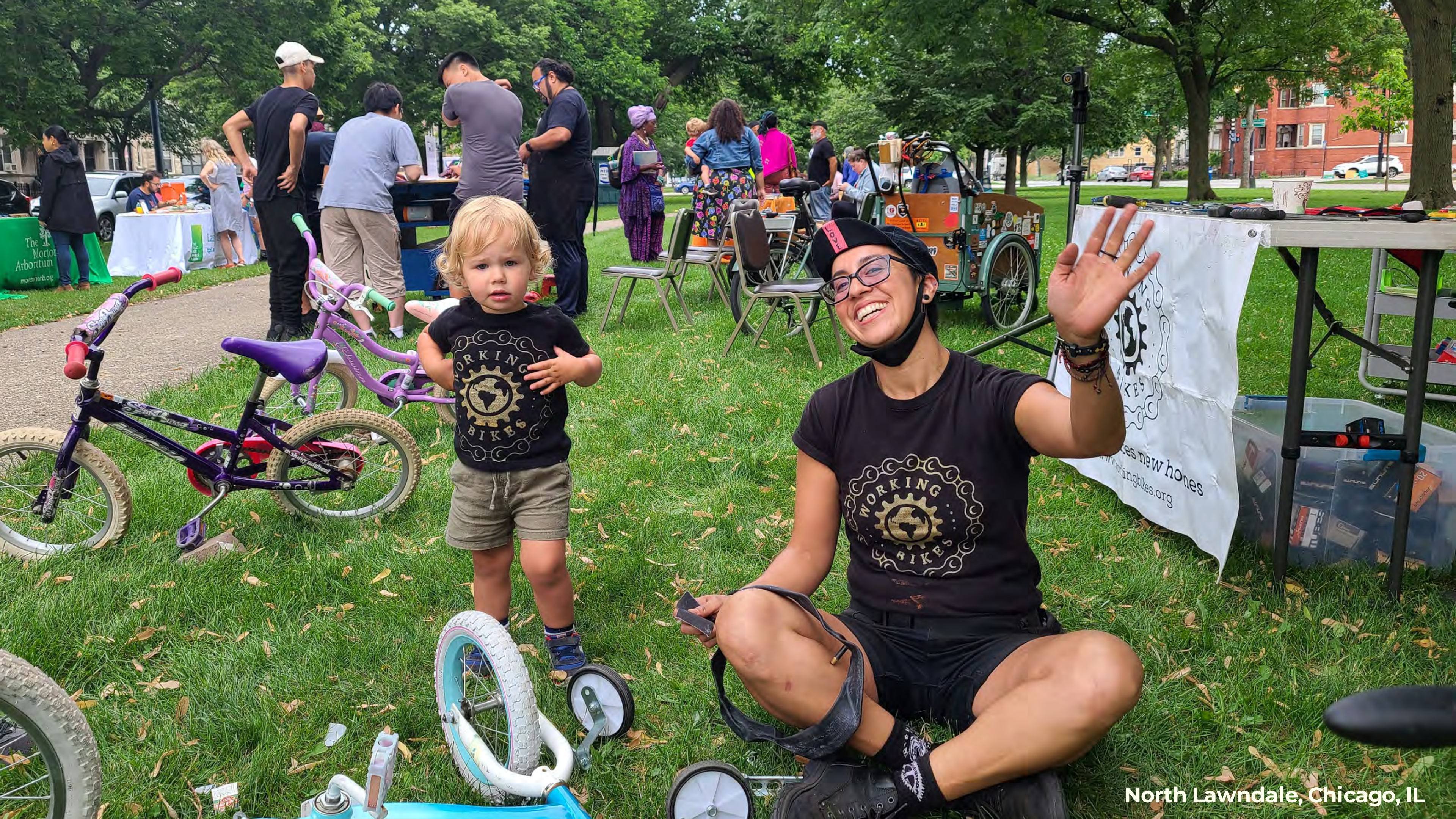
North Lawndale, Chicago, IL