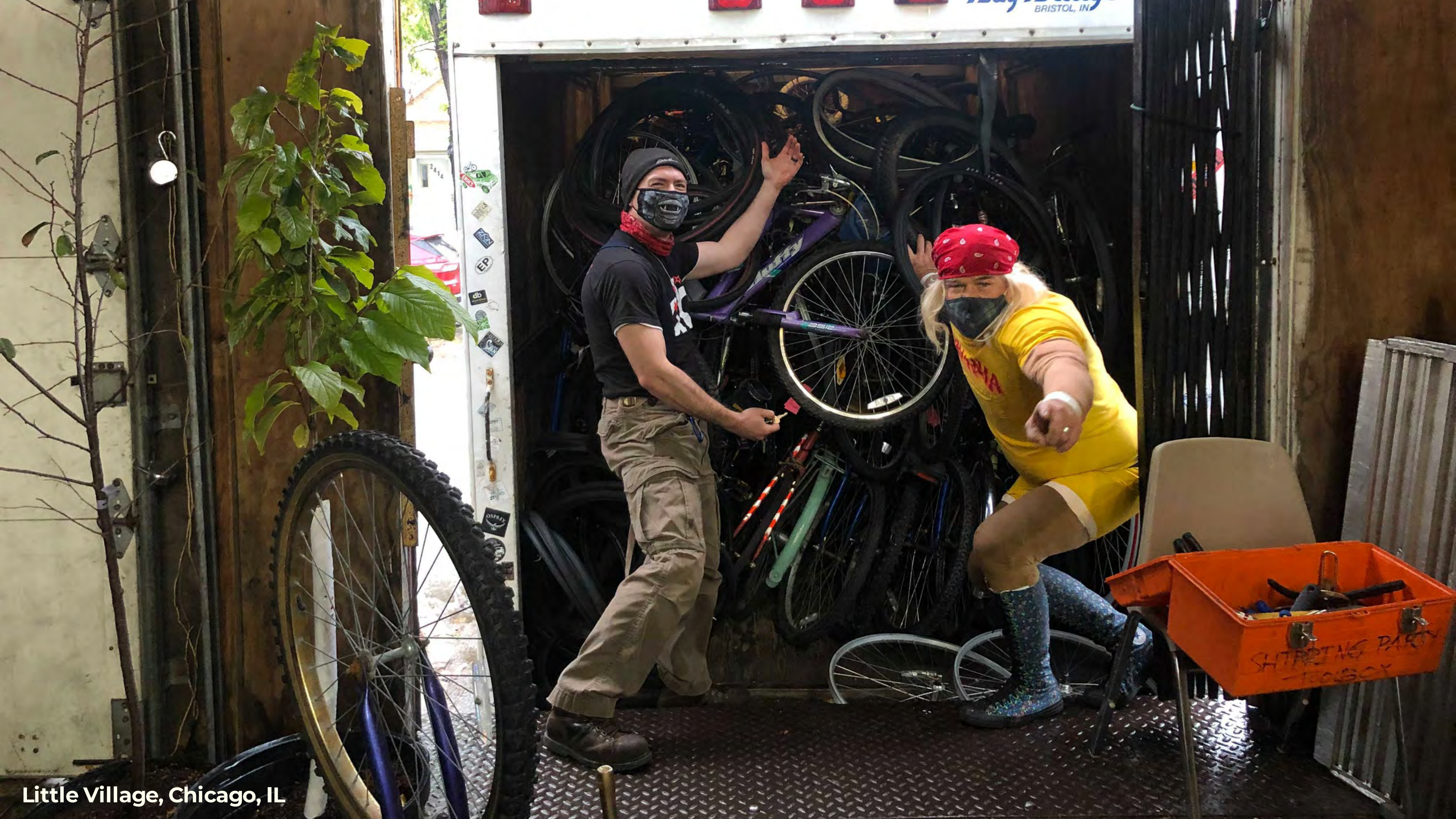
Little Village, Chicago, IL